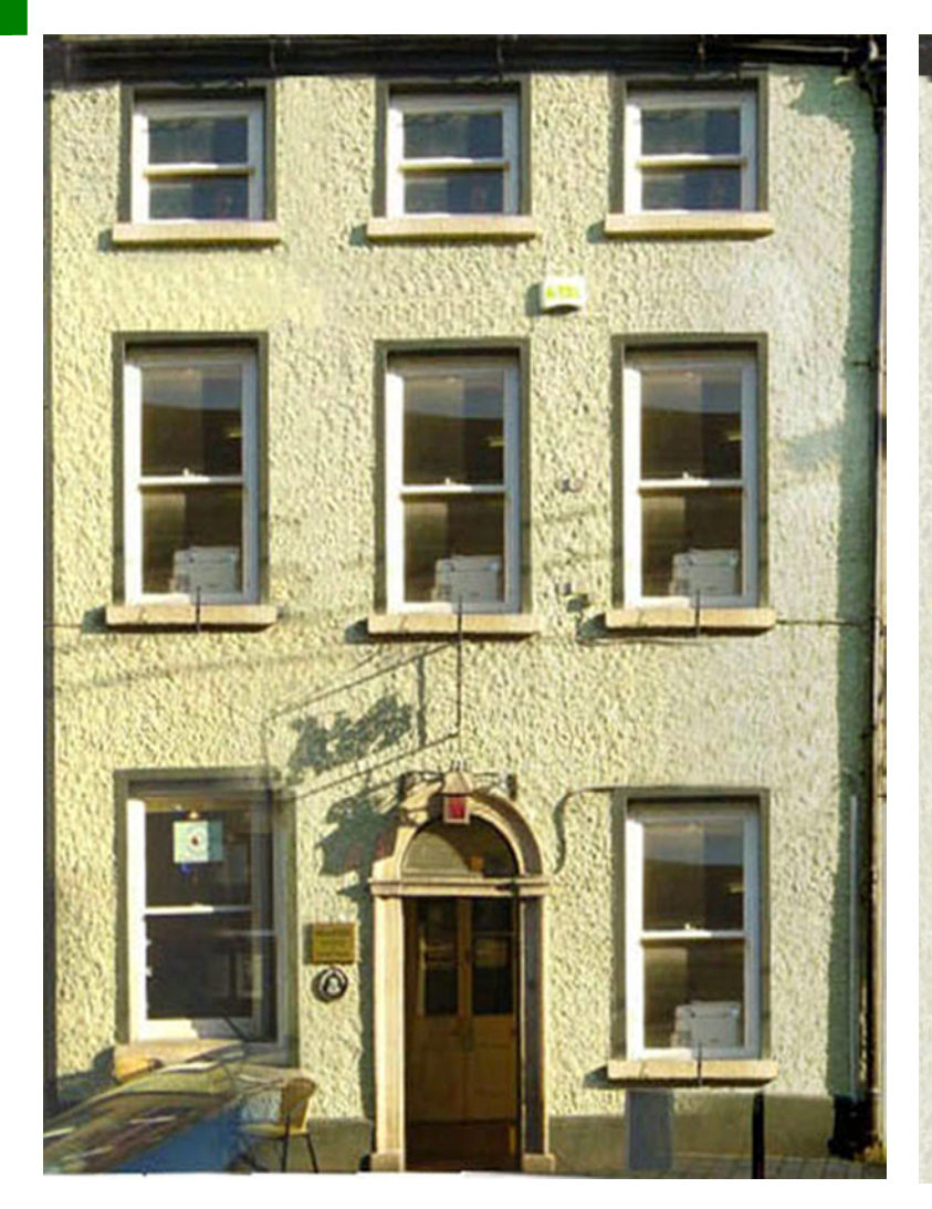
Building Elevation Study - Before Building Elevation Study - After Building Study from BIDS Scheme courtesy of DIT Dublin Road Carlow Study

Elements that could be enhanced through a BID process include;